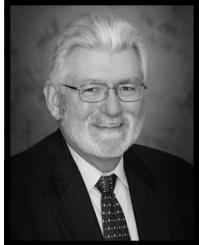
Mayor Dale Scrace